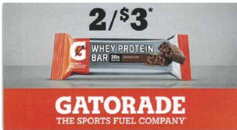
Hartshorn Dep., Ex. 8.