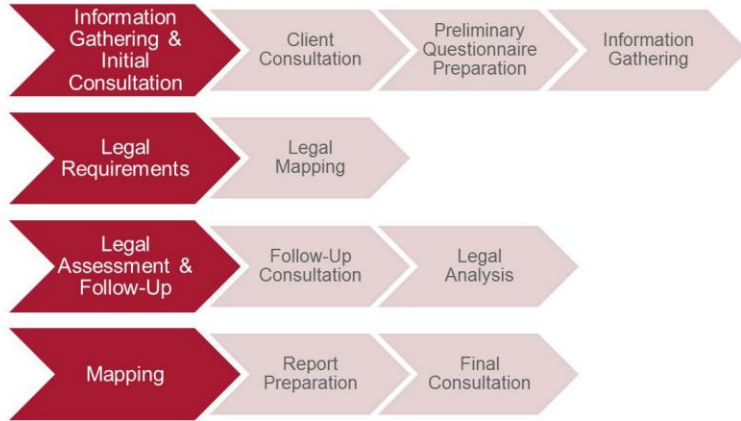
Figure iG360 Data Mapping Methodology

Please contact your usual Baker & McKenzie contact for assistance in creating a Data Map for your organisation or for getting further information on Data Mapping.